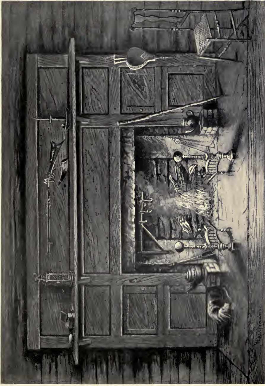
THE OLD TRAPPER'S FIREPLACE.